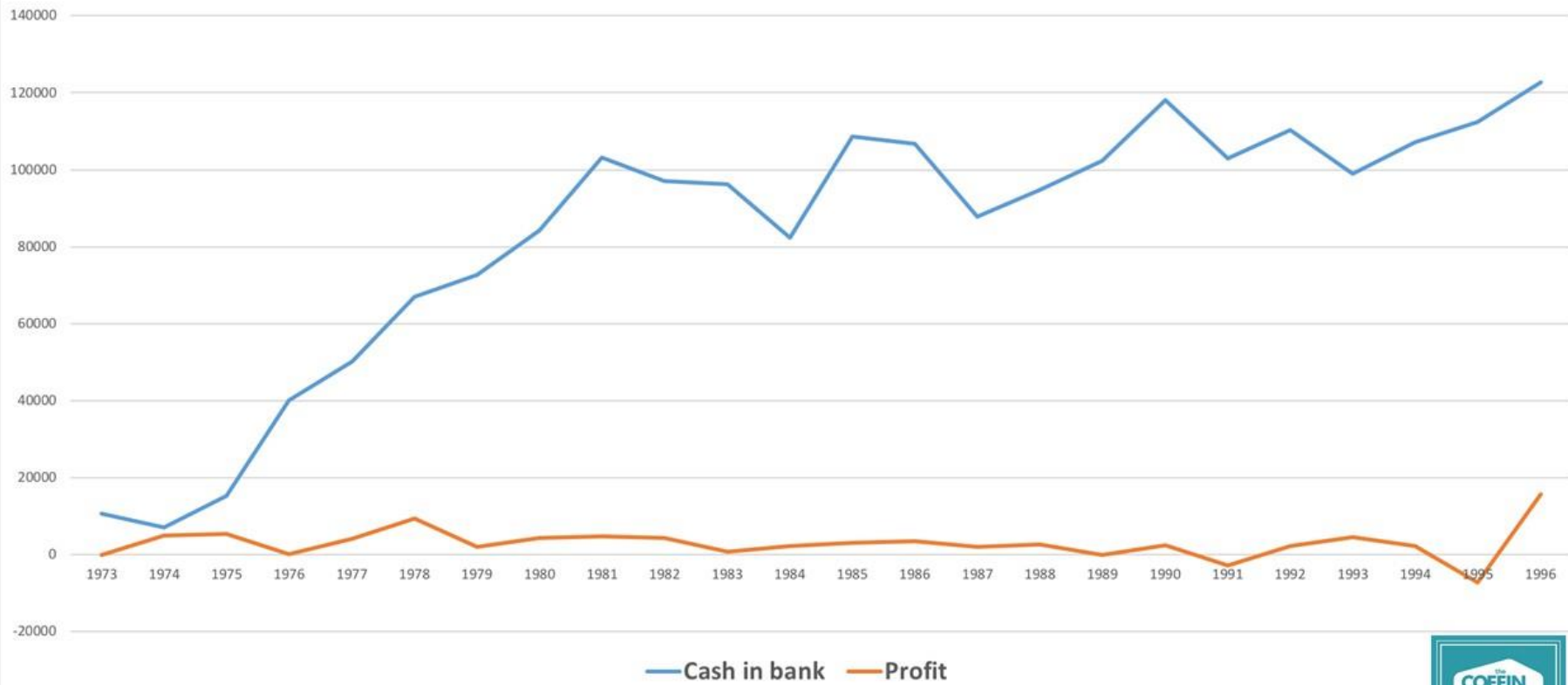
Cash in Bank Versus Profit at Newman Brothers